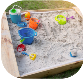
SAND OR DIRT