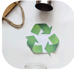
A RECYCLE SYMBOL OR SIGN