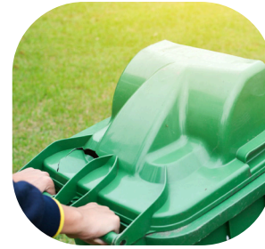
A RECYCLING BIN