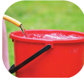
A WATER TANK OR BUCKET