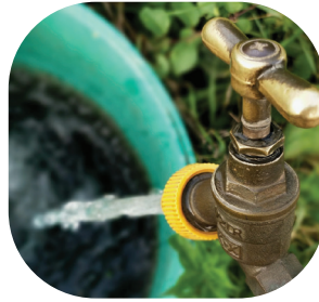
A TAP OR HOSE TO CHECK FOR LEAKS