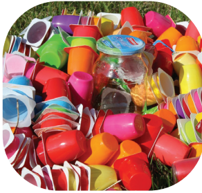
SOMETHING YOU CAN RECYCLE