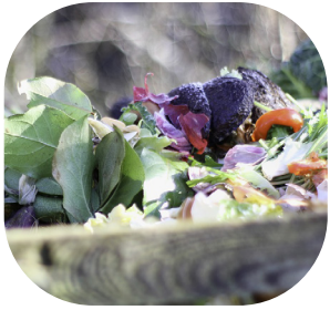
A COMPOST PILE OR BIN