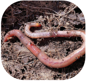
A WORM IN THE DIRT