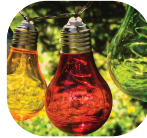
A LIGHT TO TURN OFF