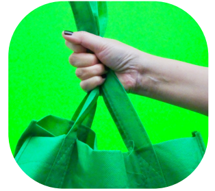
A REUSABLE SHOPPING BAG