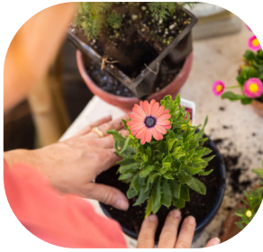
SOMETHING YOU NEED TO LOOK AFTER