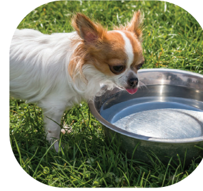
A WATER BOWL FOR ANIMALS