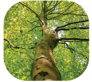
A TREE TALLER THAN YOU