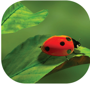
A BUG THAT NEEDS WATER