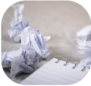
A PIECE OF RUBBISH TO PUT IN THE BIN