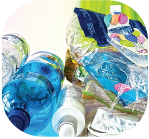
A PIECE OF PLASTIC TO RECYCLE