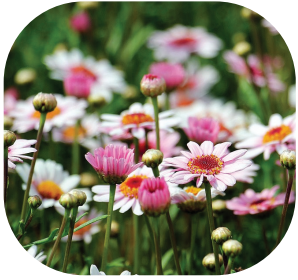
A FLOWER IN BLOOM

looking after my world set the empowered educator