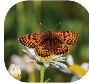
AN INSECT SPREADING POLLEN