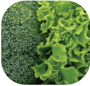
SOMETHING GREEN TO EAT