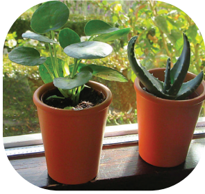
SOMETHING GROWING INDOORS OR OUT