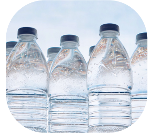
A DRINK BOTTLE YOU CAN REUSE